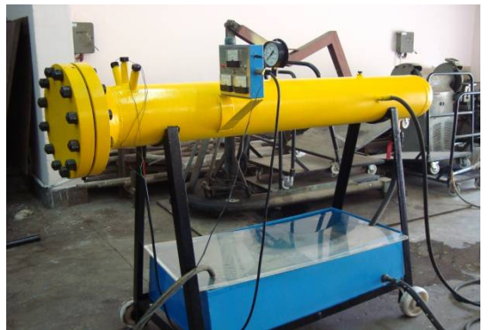
Fig 3. External Pressure Testing Equipment